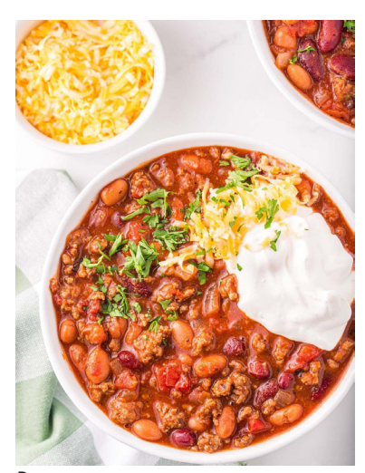
Resource: https://princesspinkygirl.com/ turkey-chili/#wprm-recipe-container-50497

Homemade Turkey Chili is quick and easy to prepare and is packed with lean protein, fiber, plenty of flavors, and is perfectly spiced to create a delicious cold-weather warming stew. This Turkey chili recipe is hearty and healthy and made with simple ingredients— it's a comforting complete one-pot meal cooked in one pot to keep you full and satisfied for hours.